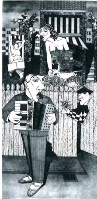
In Your Own Backyard 1979 Etching and aquatint (3rd state) 53.0 x 27.0 cm Deakin University Art Collection Printer: The Artist / Antonietta Covino-Beehre