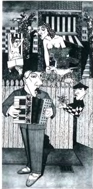
In Your Own Backyard 1979 Etching and aquatint (3rd state) 53.0 x 27.0 cm Deakin University Art Collection Printer: The Artist / Antonietta Covino-Beehre