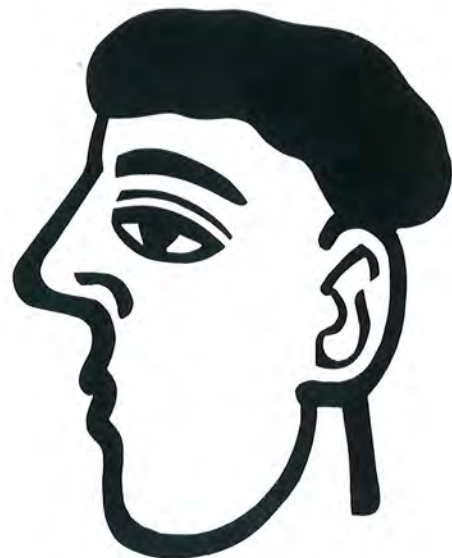
Youth 1995 Linocut 17.0 x 14.0 cm (irregular) Deakin University Art Collection Printer: The Artist