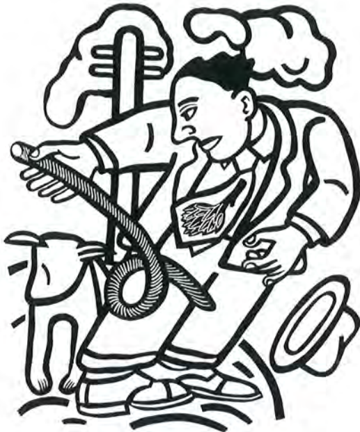
Topple Tumble 1995 Linocut 45.0 x 36.5 cm (irregular) Deakin University Art Collection Printer: The Artist