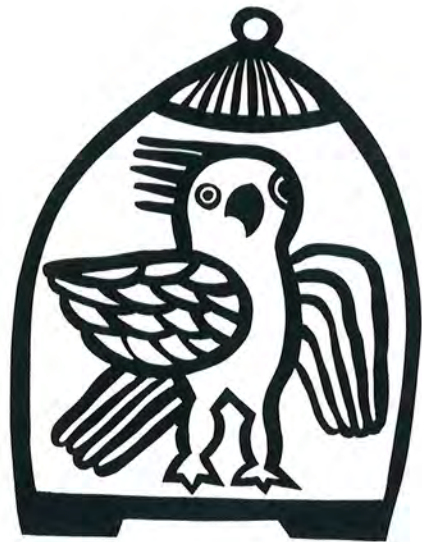
Normandy Livestock 1997 Linocut 27.0 x 20.5 cm (irregular) Deakin University Art Collection Printer: The Artist