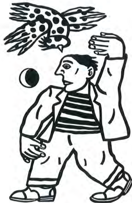
Ornithologist 1993 Linocut 51.0 x 34.0 cm (irregular) Deakin University Art Collection Printer: The Artist