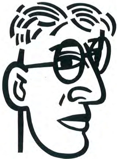
Glasses 1997 Linocut 20.5 x 14.5 cm (irregular) Deakin University Art Collection Printer: The Artist