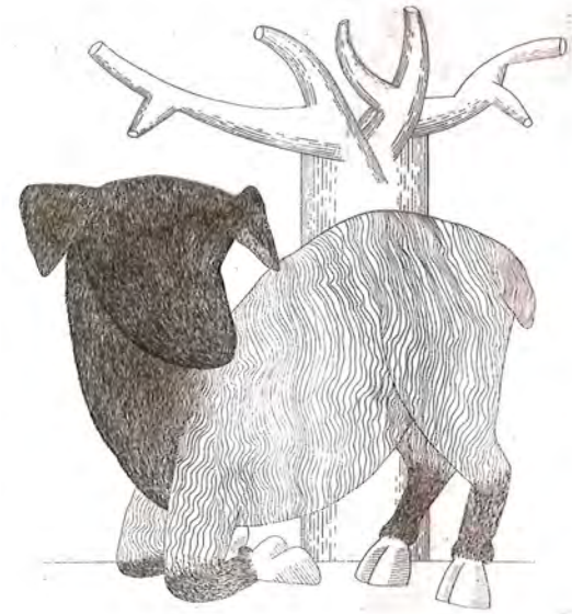
Sheep-Dog 2002 Etching (with colour roll up) 37.0 x 34.5 cm Deakin University Art Collection Printer: Martin King (Australian Print Workshop)