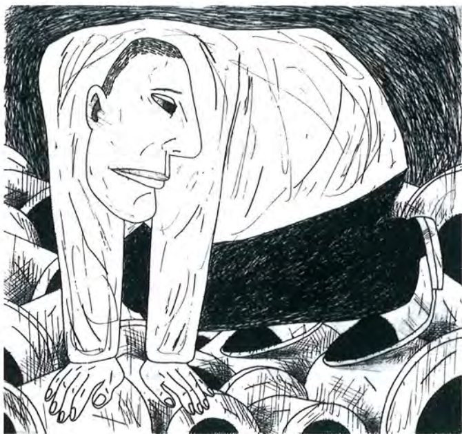
Turning for Shelter 1998 Etching 19.0 x 20.5 cm Deakin University Art Collection Printer: Anne McMaster (The Print Council Australia)