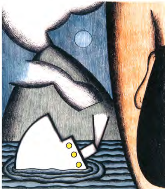
Signal not Detected 2003 Lithograph and Watercolour 24.0 x 21.0 cm Deakin University Art Collection Printer: Peter Lancaster (Lancaster Press)