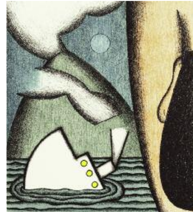
'Signal Not Detected', 2003, lithograph (four colours) + watercolour (yellow) on Somerset paper, image size 24 x 21 cm. Edition 15. Printer: Peter Lancaster (Lancaster Press)

V&A, British Museum, Science Museum, Natural History Museum, National Gallery and the Tate Gallery.